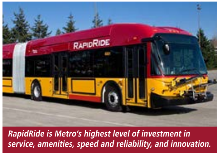
RapidRide is Metro's highest level of investment in service, amenities, speed and reliability, and innovation.

This report summarizes the outreach activities that Metro conducted throughout planning and design for RapidRide H Line.