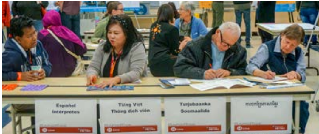
Multiple interpreters were on hand at RapidRide H Line open houses.

Sign up for Route 120 rider alerts to stay informed of any transit detours or temporary stops during RapidRide H Line construction: www.kingcounty.gov/metro/signup