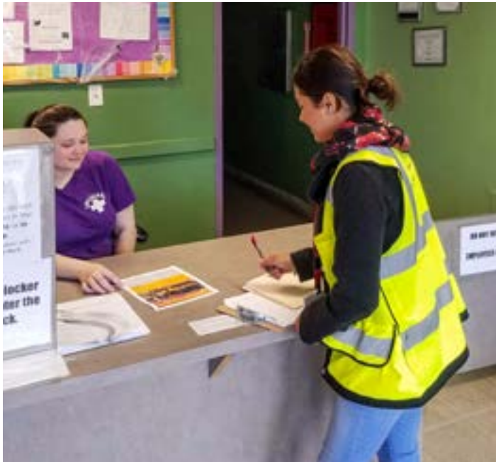
In-person outreach to local businesses and stakeholders.

The RapidRide H Line project launched the design process in late 2017 and reached final design in spring 2020.