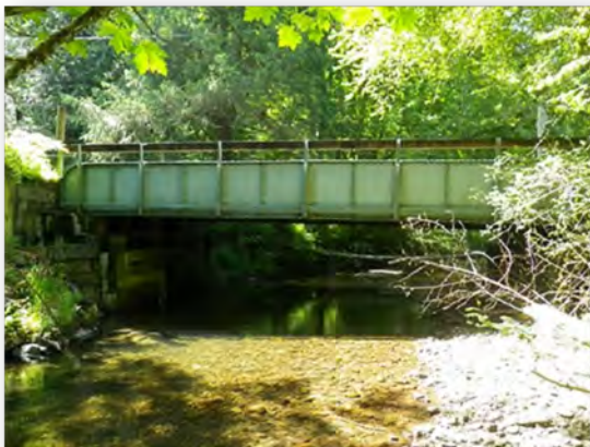
This bridge carries residents to the local community and many visitors to Lake Walker Recreational Area.