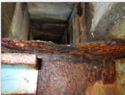
We are losing sections of steel.