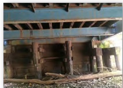
The 63-year-old creosote timbers are rotting.