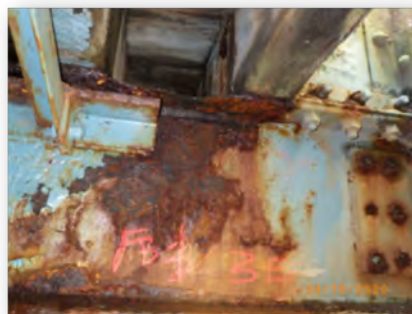
The super-structure is 108 years old and severely rusting.