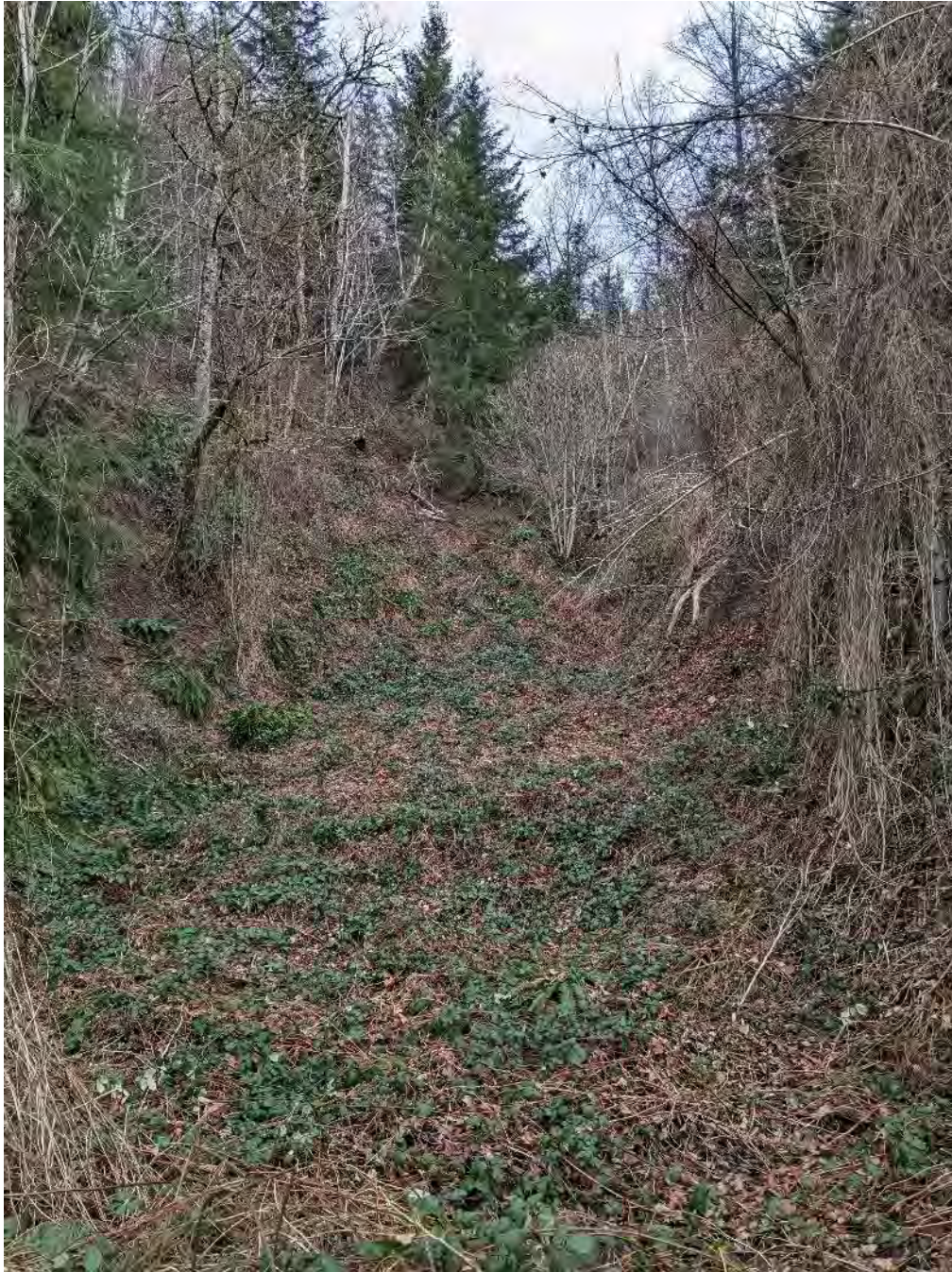
Photo H-1. Area of coal strip mining associated with the Old Carbon Mine, Southern Segale Property, on the southeast flank of Lizard Mountain.