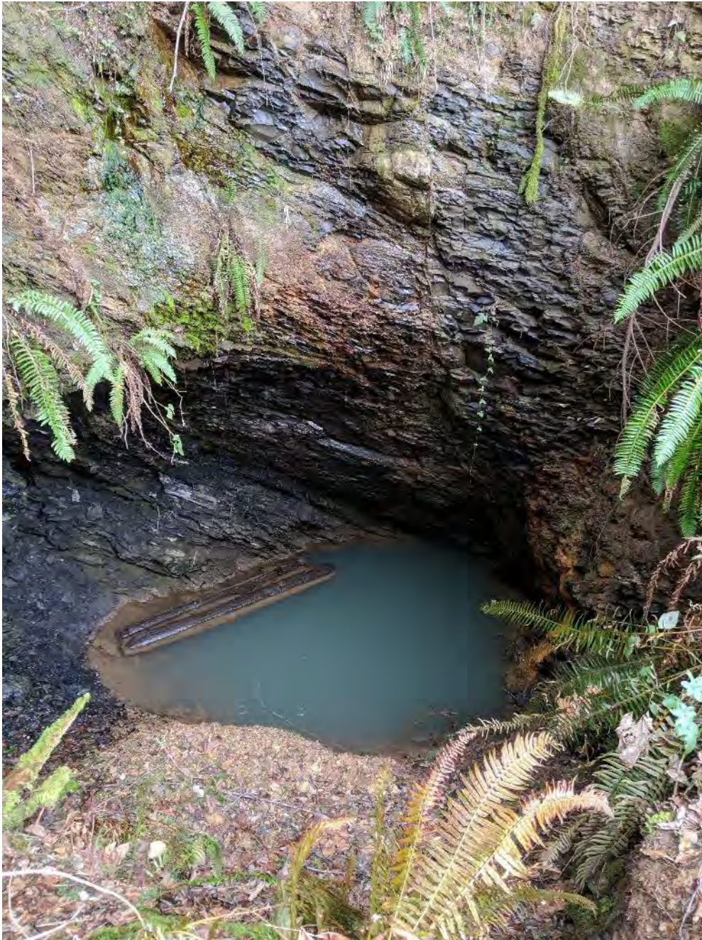
Photo H-2. Flooded coal mine entrance on the southwest flank of Lizard Mountain in the mapped area of the Carbon Fuel Company No. 4 mine.