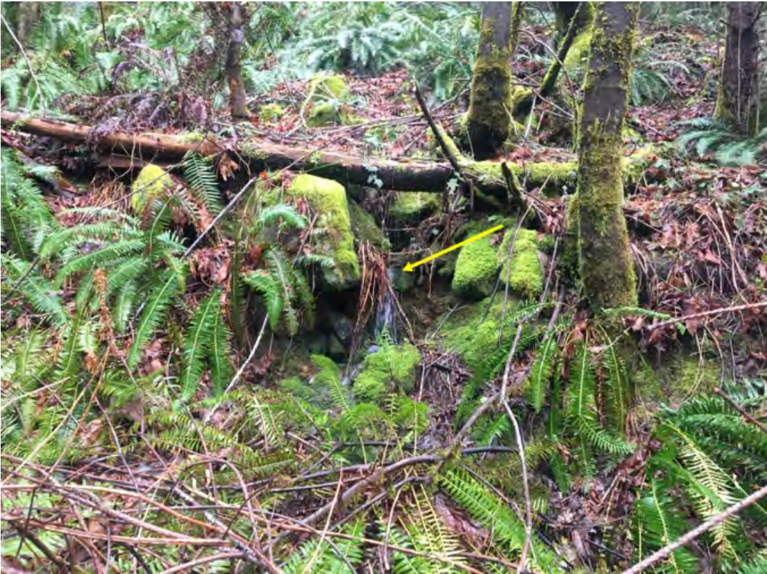
Photo H-3. Water flowing from a suspected collapsed coal mine opening on the south flank of Lizard Mountain.