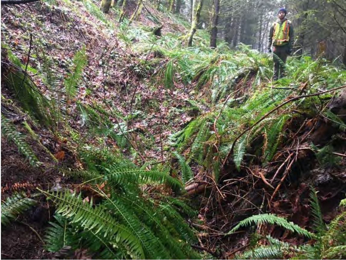
Photo H-4. Suspected subsidence feature on the southwest flank of Lizard Mountain overlying mapped workings of the Carbon Fuel Company No. 4 Mine.