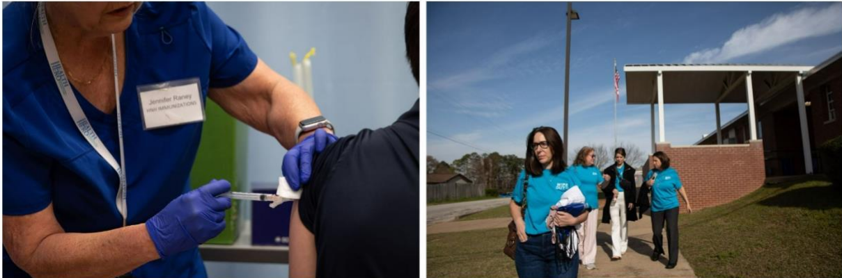
HPV vaccinations were administered at W.F. Burns Middle School in Chambers County where cervical-cancer rates are more than four times higher than the WHO's elimination target.

Alabama hospitals send buses to screen women deep in the country, where gynecologists are scarce. Traveling nurse practitioners examine women with abnormal results closer to home and without extra cost.