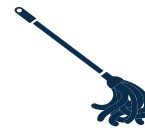
Disposable Mop Head