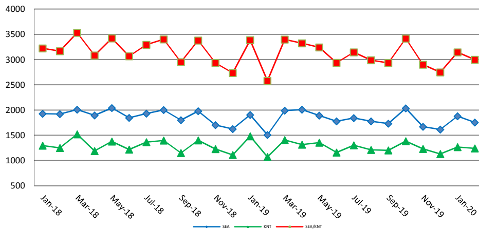
Figure 2. Monthly Resolutions for SEA, KNT and SEA/KNT Combined