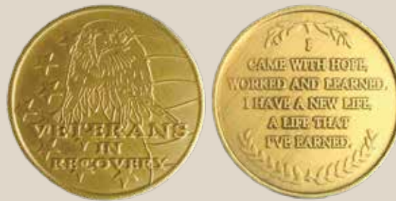
Inspirational medallion given to RVC graduates